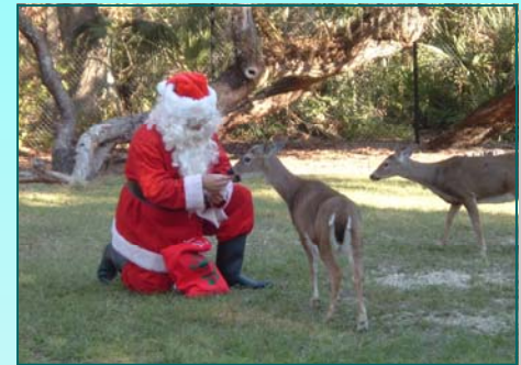
Santa feeds the Key Deer some Christmas treats!

Sponsored by The Friends of Homosassa Springs Wildlife Park, Citrus County Chronicle, Citrus 95.3 FM and Classic Hits 96.3 FM.